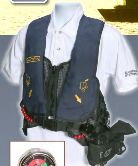
Switlik X-Back Air Crew Life Vest with attached HEED 3