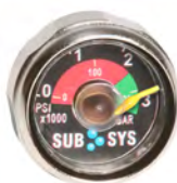
Dial Gauge is standard on all HEED 3s

The Helicopter Emergency Egress Device (HEED 3) is a compact, lightweight and reliable Category A device designed to increase survivability in case of an unintended submersion in water. Born out of a need to provide US Navy helicopter pilots with a small, handheld breathing device the Heed 3 has been saving lives since 1979. Ideal for all helicopters, fixed wing aircraft, float planes, watercraft and vehicles that operate around possible water emergencies. Over 400,000 systems sold worldwide in over 45 years. Tested & approved by the US Navy.